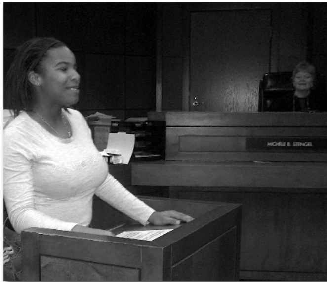
A teen attorney from Jefferson County Teen Court (KY) makes her opening statement.