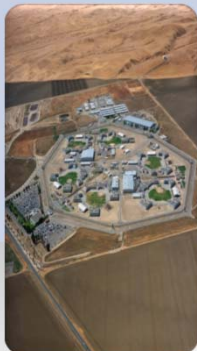
AVENAL STATE PRISON LEVEL II GP & SNY