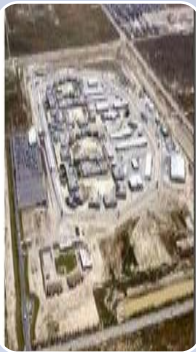
CALIFORNIA STATE PRISON LOS ANGELES COUNTY LEVEL III/GP