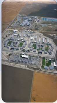
PLEASANT VALLEY STATE PRISON LEVEL III GP & SNY