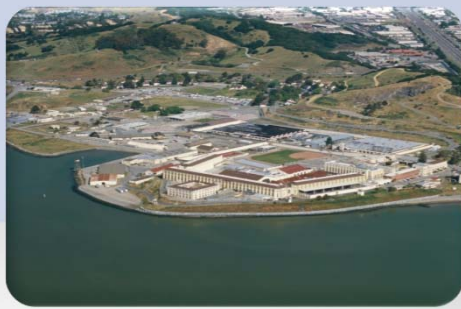
SAN QUENTIN STATE PRISON LEVEL II/GP