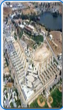
CALIFORNIA REHABILITATION CENTER LEVEL II-GP & SNY