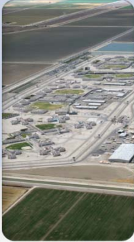
SUBSTANCE ABUSE TREATMENT FACILITY-LEVEL III/SNY