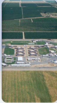
VALLEY STATE PRISON LEVEL II SNY