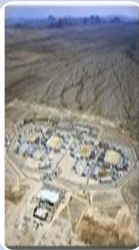
IRONWOOD STATE PRISON LEVEL III-GP & SNY