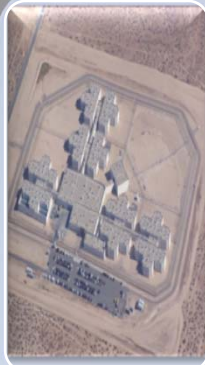
CALIFORNIA CITY CORRECTIONAL FACILITY LEVEL II-GP