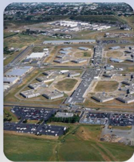
CALIFORNIA STATE PRISON-SOLANO LEVEL II/III/GP